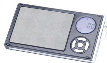
LC PDA 口袋秤 Pocket Scale Capacity: 300g/0.1g, 50g/0.01g