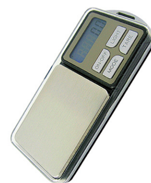
LC MINI 6 口袋秤 Pocket Scale Capacity: 300g/0.1g, 50g/0.01g