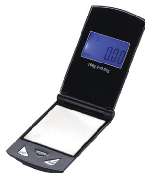
LC UB 口袋秤 Pocket Scale Capacity: 50g/0.01g, 100g/0.01g