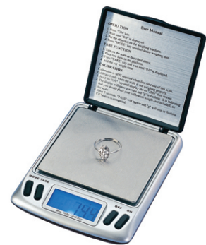
LC WLI 口袋秤 Pocket Scale Capacity: 100g/0.01g, 200g/0.01g 300g/0.05g, 500g/0.1g