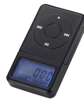
LC MINI 4 口袋秤 Pocket Scale Capacity: 300g/0.1g, 50g/0.01g