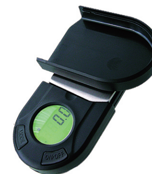
LC MINI 3 口袋秤 Pocket Scale Capacity: 300g/0.1g, 50g/0.01g