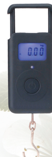
LC HGS 钓鱼秤 Hanging Scale Capacity: 10kg/10g, 15kg/10g 20kg/20g, 30kg/50g