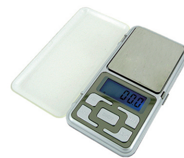
LC MH 口袋秤 Pocket Scale Capacity: 350g/0.1g, 500g/0.1g 100g/0.01g, 200g/0.01g, 300g/0.01g