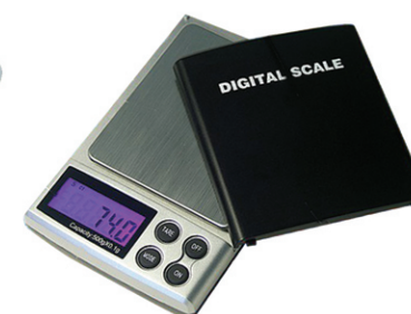
LC PD 口袋秤 Pocket Scale Capacity: 200g/0.1g, 500g/0.1g 50g/0.01g, 100g/0.01g