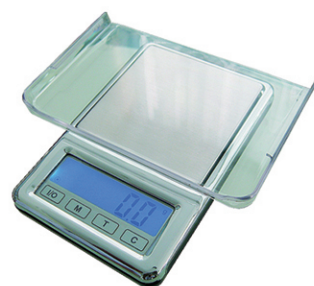
LC TS 口袋秤 Pocket Scale Capacity: 350g/0.1g, 500g/0.1g 100g/0.01g, 200g/0.01g