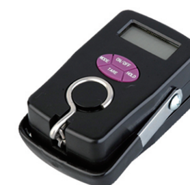
LC HGW 钓鱼秤 Hanging Scale Capacity: 50kg/10g, 50kg/20g 50kg/30g, 50kg/50g