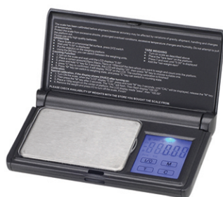
LC BS 口袋秤 Pocket Scale Capacity: 350g/0.1g, 500g/0.1g 100g/0.01g, 200g/0.01g