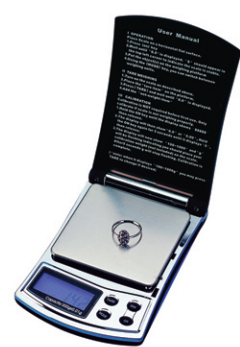
LC BY 口袋秤 Pocket Scale Capacity: 500g/0.1g, 1000g/0.1g 100g/0.01g, 200g/0.01g, 300g/0.01g