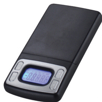
LC E 口袋秤 Pocket Scale Capacity: 100g/0.01g