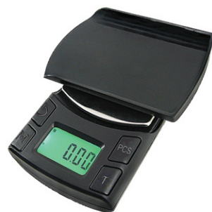
LC SP 口袋秤 Pocket Scale Capacity: 350g/0.1g, 500g/0.1g 50g/0.01g, 100g/0.01g