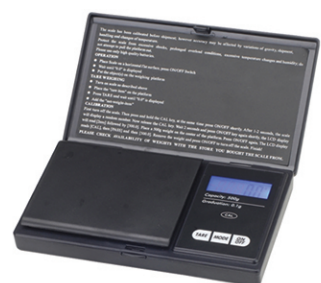
LC MS 口袋秤 Pocket Scale Capacity: 350g/0.1g, 500g/0.1g 100g/0.01g, 200g/0.01g, 300g/0.01g