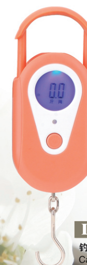
LC HGF 钓鱼秤 Hanging Scale Capacity: 10kg/10g, 15kg/10g 20kg/20g, 30kg/50g