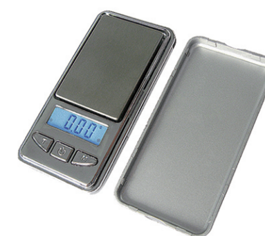
LC MINI 1 口袋秤 Pocket Scale Capacity: 300g/0.1g, 50g/0.01g