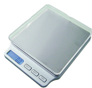
LC TP 口袋秤 Pocket Scale Capacity: 2000g/0.1g, 500g/0.01g