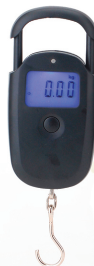
LC HGT 钓鱼秤 Hanging Scale Capacity: 10kg/10g, 15kg/10g 20kg/20g, 30kg/50g