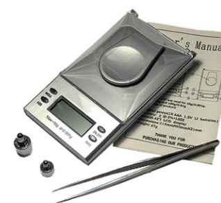
LC MB 口袋秤 Pocket Scale Capacity: 10g/0.001g, 20g/0.001g 30g/0.001g